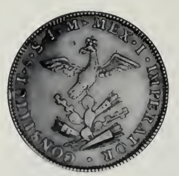
Lot No. 2468

Agustín Iturbide. 8 Escudos, 1822 Mo-JM. Obv. Long, narrow bust with curved truncation. Rv. Crowned eagle perched on cactus. KM 313.1, Fr.59. A Nice Very Fine, almost Extremely Fine. (1.750-2.250)